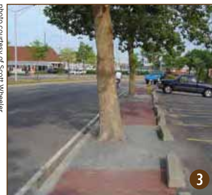
Figure 3 Stone dust is placed around the root flare of the tree in cutouts along this brick sidewalk. This technique is attractive and allows for easy repair as roots expand in diameter.

Surface materials like gravel, limestone, or stone dust allow continued root growth and expansion (Figure 3). The surface can be easily repaired as roots continue to expand in diameter. Crushed rock is inexpensive and easy to install, and the surface is porous. It is best used on fairly flat surfaces because rain can cause erosion on sloping ground. The use of brick pavers, shown in the picture, provides a route for pedestrians walking from the parking lot to the other side of the street. Displaced stones will need to be replaced occasionally, and may be a nuisance when using equipment such as a leaf blower (Gibbons, 1999).