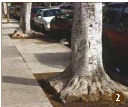
Figure 2 Main supporting roots were cut. These trees, once of value to the landscape, are now at high risk for failure and should be removed before they fall over.