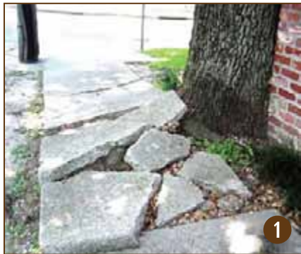
Figure 1 Sidewalk located too close to the root flare of a large tree.

When root pruning is necessary, the general guideline is to preserve all roots within an area about five times the trunk diameter. For example, if the trunk diameter is two feet, than do not prune roots within ten feet of the trunk. Although this will not guarantee that tree will remain erect, it is better than cutting closer to the trunk.