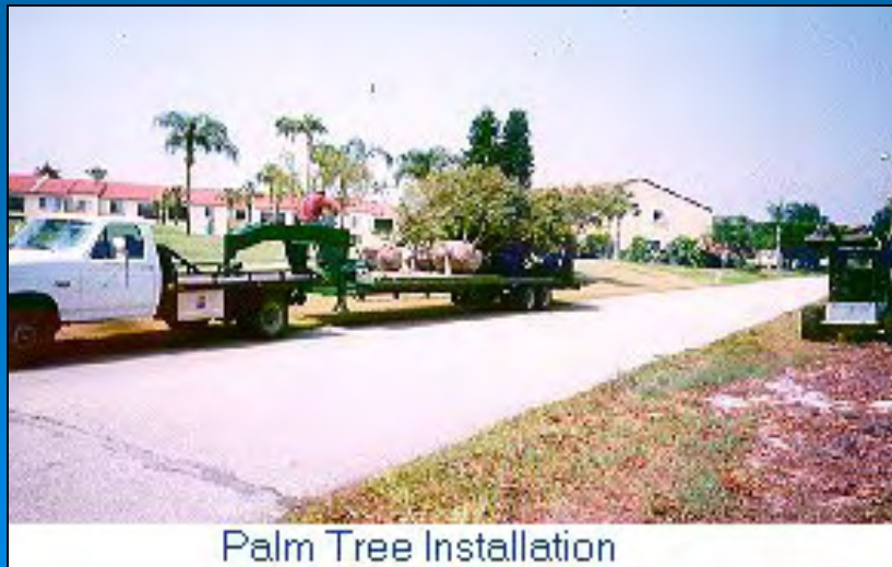
Palm Tree Installation