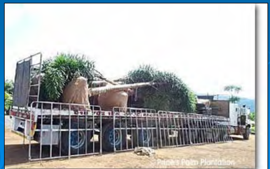
Price's Palm Plantation