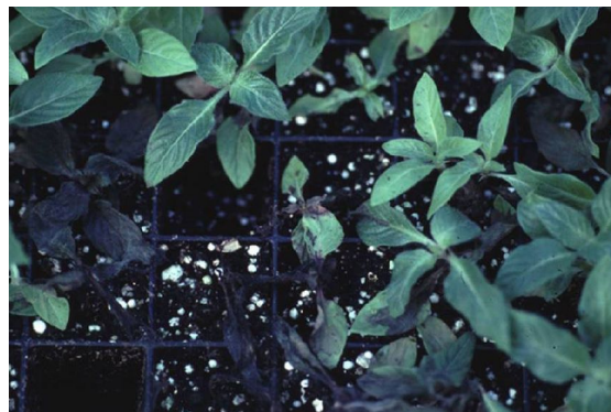
Figure 3. Diseased seedlings in flat.

Some pathogens can be carried from plant to plant on hands and tools, especially pruning tools. It is important to disinfect hands and tools that are used with plants. For tools, a 20-30% solution of household bleach or pine oil product in water makes a good disinfectant. Rubbing alcohol from the drug store will also work, as will trisodium phosphate available from orchid supply stores and web sites. Soak the tool at least 5 minutes, and then rinse with clean water or allow to air dry. Washing your hands with soap under running water is all that is necessary to clean your hands after working with diseased plant material. In general, plant pathogens are not harmful to humans.