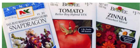
Figure 2. Seed packets.

plants with some level of resistance to the targeted plant pathogen can be found (Fig. 2). Merely choosing and planting these varieties will reduce disease problems. This is your first line of defense! There are also varieties that show more tolerance for specific diseases. In spite of the fact that these plants may seem to have as many symptoms as those that are not tolerant, somehow they still thrive and produce.